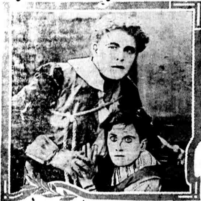
THE ADVENTURER... WILLIAM FOX PRODUCTION

America's Favorite Dramatic Actor WILLIAM FARNUM in