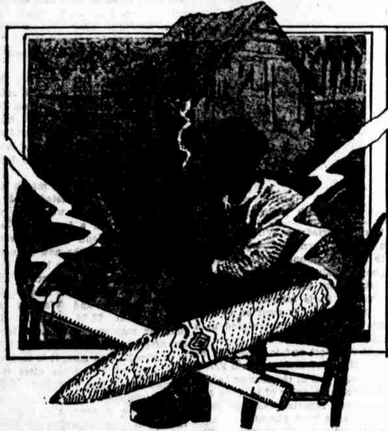
This Young Mountain Matron Is Enjoying Her Afternoon Chew While Her Husband Smokes His Favorite Pipe.

Here is an unusual picture of marital felicity. It was snapped by a worker for the Interchurch World Movement during a survey of living conditions in the Tennessee Mountain district. The young woman in the picture, a bride of a few weeks, is using the mountain substitute for the cigarette, a "snuff stick"—a stick coated with snuff and industriously chewed. The habit has two advantages over the gold-tipped cigarette of the city girl. It is more economical and it lasts longer—a well made "snuff stick" having only one rival for longevity—the "all day sucker" of school days. The Interchurch World Movement finds distressful ignorance and poverty among these mountain folks and suggests a new religious program—to couple the Bible with practical instruction in agriculture, carry it out on model farms, with schools, good roads and other community needs as the ultimate goal.