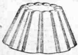
Individual dessert molds

Ten Flavors in Glass Vials Bottle in Each Package Mint Lime Cherry Raspberry Loganberry Strawberry Pineapple Orange Lemon Coffee