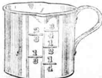
Jiffy-Cup for measuring

An aluminum half-pint cup. Fill twice with water to dissolve one package Jiffy-Jell. Use as an exact cup measure in all recipes. Send 2 trade-marks for it.