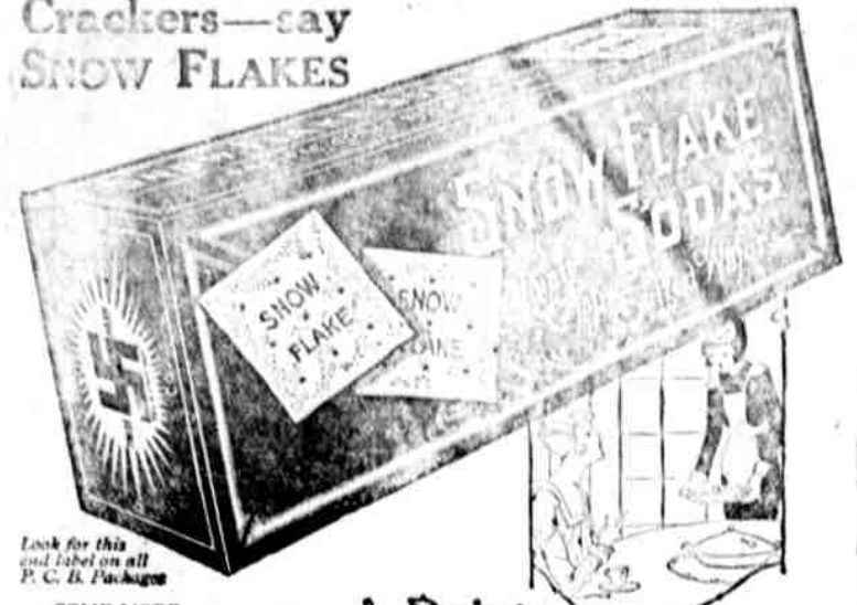
Look for this seal label on all P. C. B. Packages