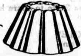
Individual dessert molds

We offer you choice of several 50-cent molds if you will do this, and at once. Cut out our offer so you won't forget.