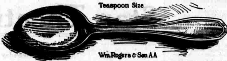
Wm. Rogers & Son AA

An aluminum half-pint cup. Fill twice with water to dissolve one package Jiffy-Jell. Use as an exact cup measure in all recipes. Send 2 trade-marks for it.