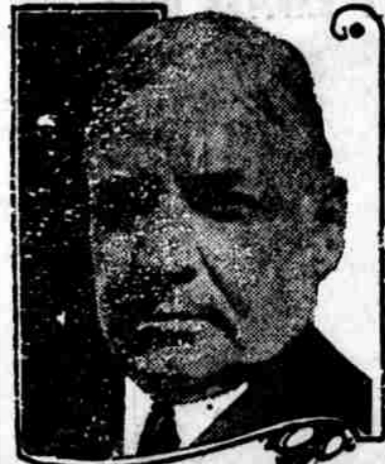
Presidential booms are numerous in Republican ranks now, among them being the hat tossed into the ring by Governor Frank C. Lowden of Illinois. This new picture is from Washington, where he appeared recently with the special Senate committee appointed to consider a national budget.