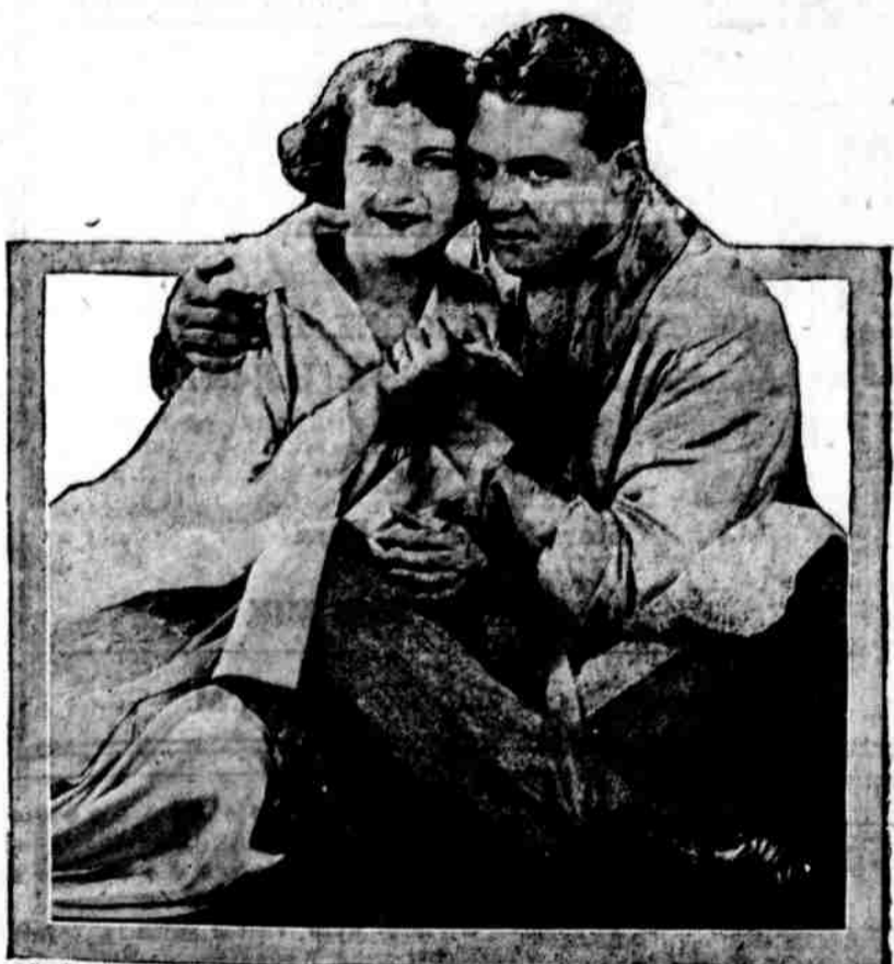
VIOLA DANA in "PLEASE GET MARRIED"