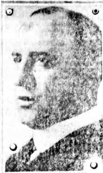
Edwin P. Morrow, Governor-elect of Kentucky