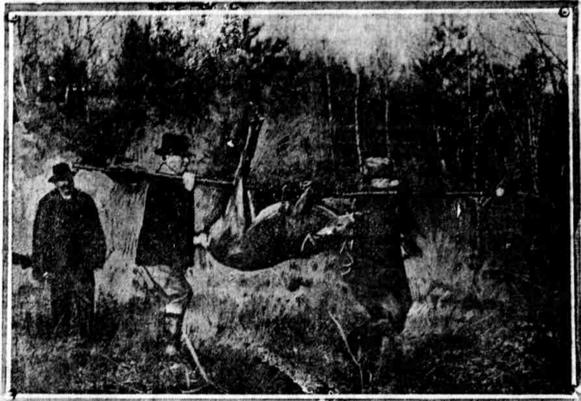
Although New York is the most popular center in the United States, if not the world, the New York sportsman doesn't have to go far to enjoy good sport. This photograph shows deer hunters carrying a 180-pound buck back to their camp near Forestburg, Sullivan county—only about 75 miles from the metropolis.