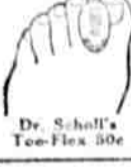
Dr. Scholl's Toe-Flex Shoe

No matter where or how your feet ache, hurt or burn, or if they feel tender and sore, there is a scientific corrective to give you