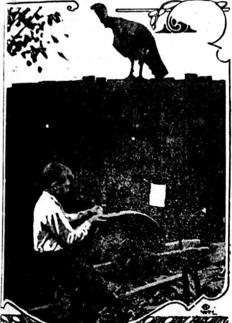
ind Another King Is About To Lose His Crown.