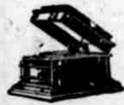
$50, $70, $75