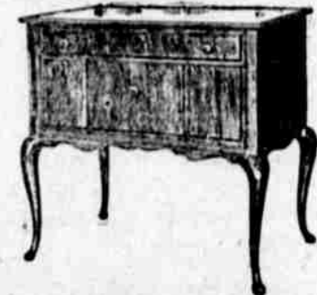
Period Models, $225.00 up