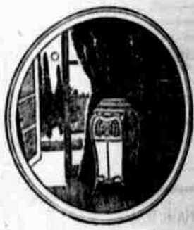
$200.00, $275.00, $350.00