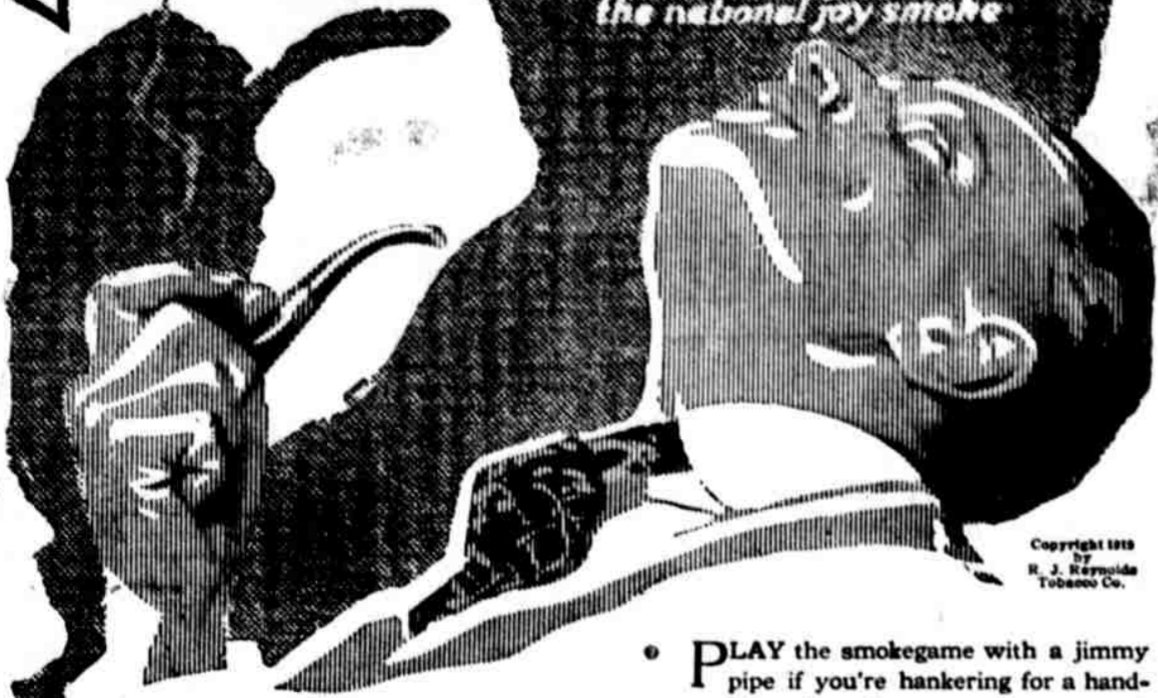
Copyright 1918 By R. J. Reynolds Tobacco Co.

• PLAY the smokegame with a jimmy pipe if you're hankering for a hand-out for what ails your smokeappetite!