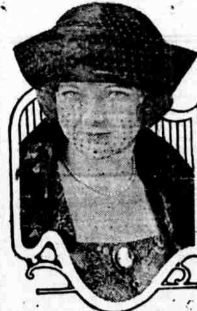
A pleasing effect for driving or street wear this fall. The veil is dotted with a fine mesh. Briscoe car $475 at Howie's. Just giving it away. 24-2t