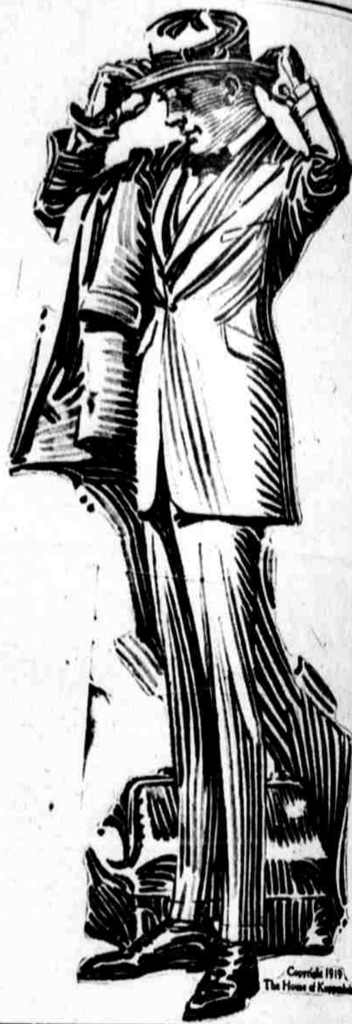
Copyright 1919 The House of Kuppenheimer