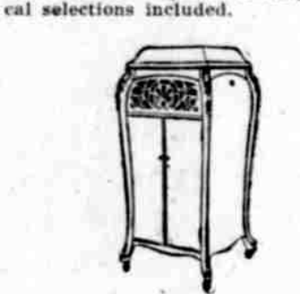
Sonora Grand $300.00