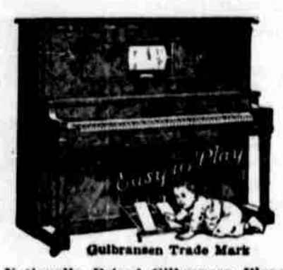
Nationally Priced Gilbransen Player

Pay a fair payment down, then as low as $10.00 to $12.00 a month.