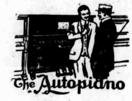
The Auto Piano

Several styles in stock at $750.00 and $800.00 Uncle Sam's choice for tone, durability and quality. Terms may be arranged and silent planes taken in as part payment.