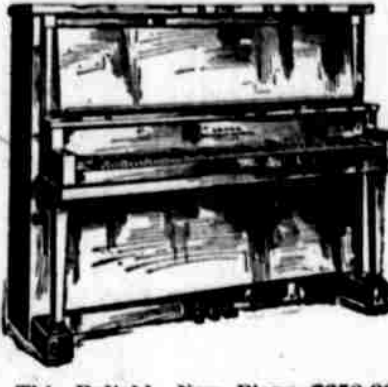
This Reliable New Piano $850.00

Most people think that because Sonora received the Highest Award for Tone that the prices and terms might be high.