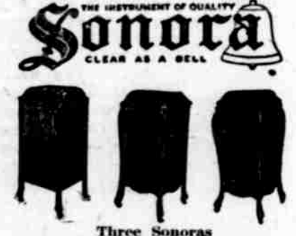
at $100.00, $150.00, $200.00

Most people think that because Sonora received the Highest Award for Tone that the prices and terms might be high.