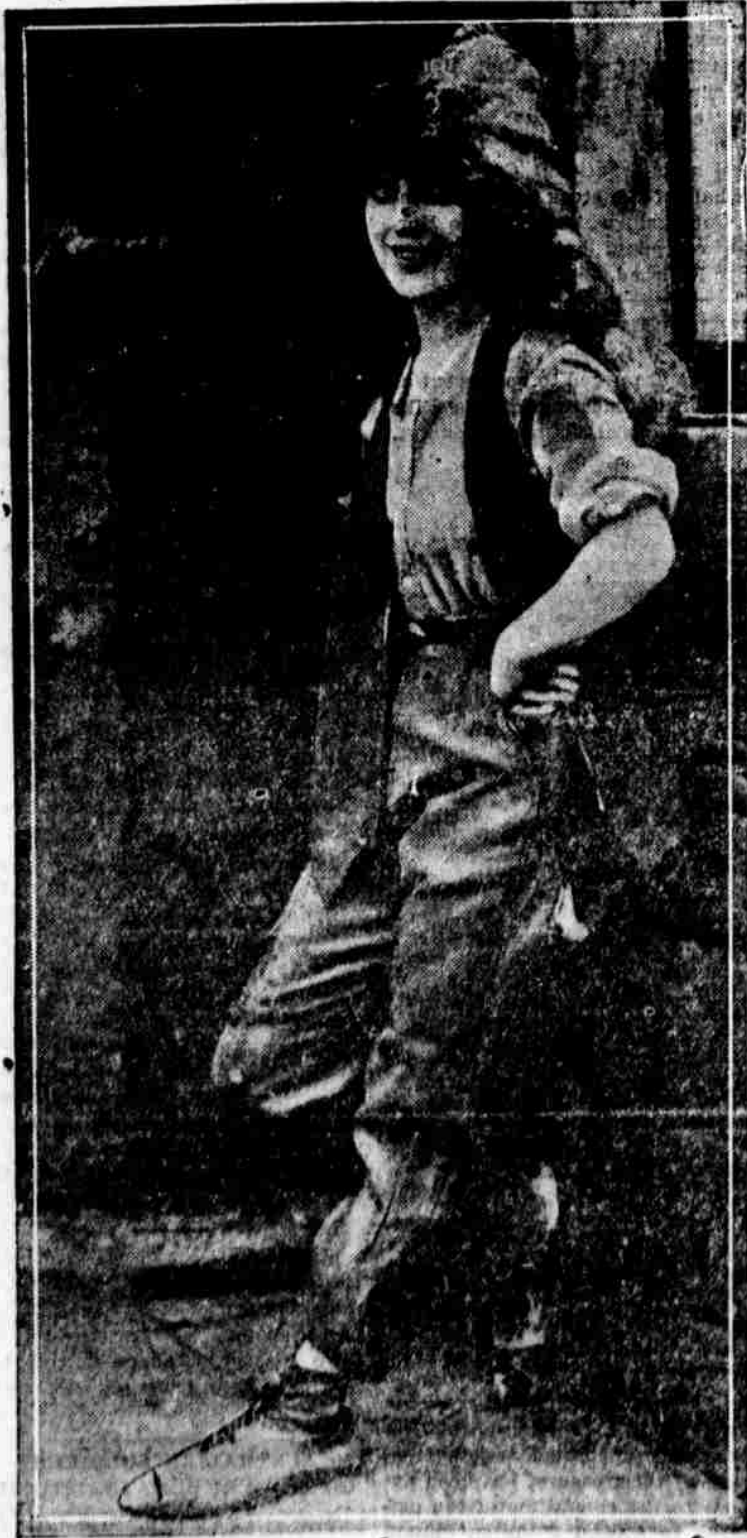
The Picture You Will Never Forget

Matinees ..... 10 and 25 Cents Evenings ..... 15 and 35 Cents