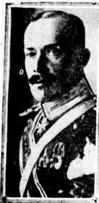
Prince of Wied

Smuggling by airplane sounds easy, but seemingly it isn't. The Prince of Wied, according to cable reports, decided that jewels and other valuables belonging to the royal house of Saxony would be safer in Sweden than in Germany. Thousands of dollars' worth of gems and securities were dropped from a plane near Malmö, on the south coast of Sweden, but customs officials caught the prince's confederates just after they had picked up the precious packages.