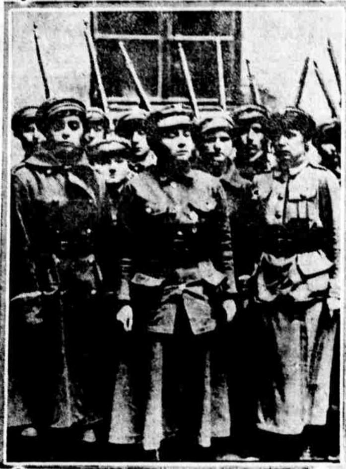
Women members of the Polish army who helped defeat the Ukrainian army in a severe battle in Lemberg, in which they lost many of their number. The photograph shows the leading women commanders.

worked on the problem of devising means to wipe the submarine out of existence, the sub-surface craft remains the only long-radius vessel that, alone and unsupported, can go nearly anywhere and, entirely discounting its main purpose of torpedoing enemy warships, its unique defensive qualities makes it a naval weapon of the utmost usefulness even when restricted in its use against merchant shipping.