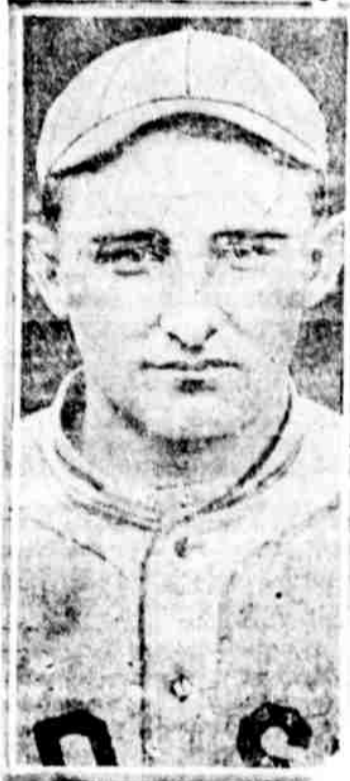
Carl Mays, said to be one of the best pitchers in the American League, was bought at a record-breaking price from the Boston Red Sox by the New York Yankees, and then suspended by Ban Johnson, president of the league. We thought wars were over.