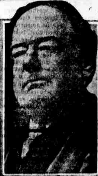
Chief Justice White

"I happen to be secretary of war." (Newton D. Baker.) That is the best explanation so far made on the subject.—Detroit Journal.