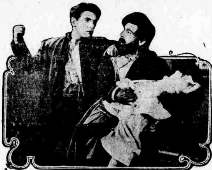
A thrilling scene from "A Man's Country," starring Alma Rubens.

Two spectacular bar room battles are fought at the climax of—