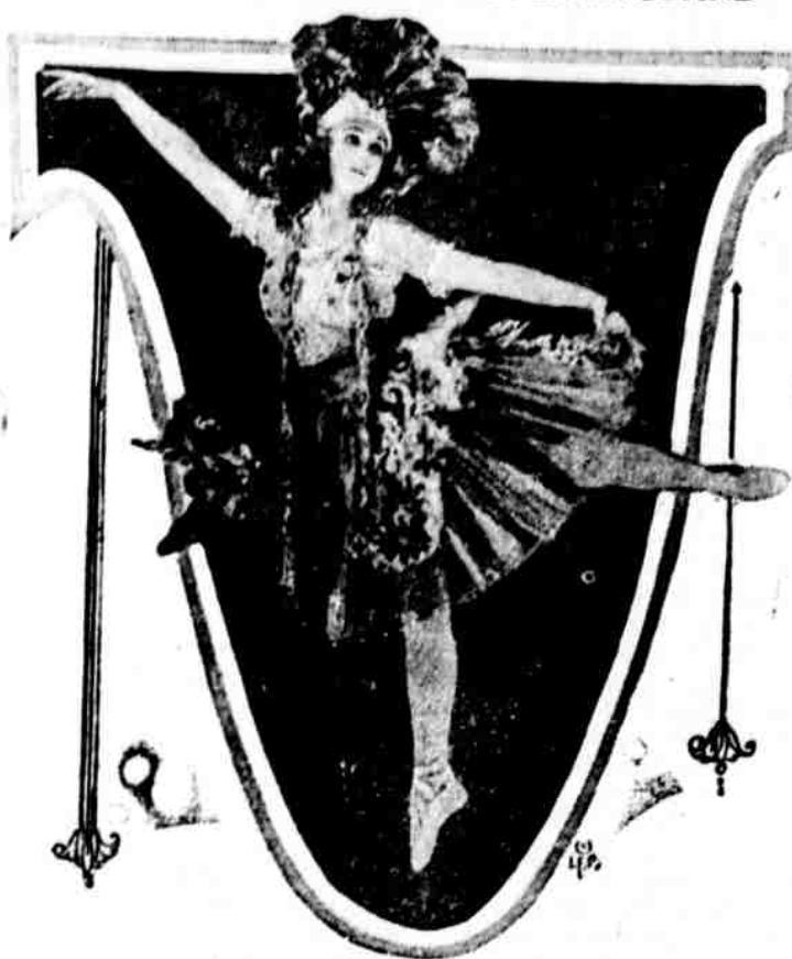
Mme. Tamar Karsevina

Mme. Tamar Karsevina, who is appearing in a season of Diaghileff's Russian ballets in London, is the most talked-of woman in England and on the continent. This portrait study shows her in the startling costume of "The Firebird."