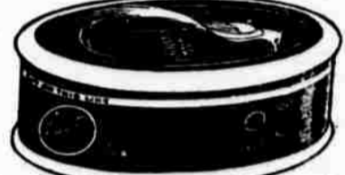
The only way to secure Satin Skin is to use Jonteel Cream and Jonteel Face Powder ..... 50c Each