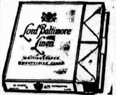
FOR YOUR SUMMER OUTING by all means take Lord Baltimore Stationery—in boxes ..... 85c Portfolios ..... 50c

and this is the place to buy them. We carry all standard brands—including Bouquet, Jeanice, as illustrated—only ..... 50c