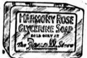
A GLYCERINE SOAP surpassing all other Soap 15c Cake.