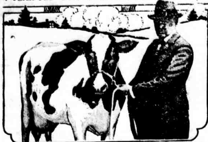
A seven-year-old cow weighing 1615 pounds, claims to be the champion milk producer of the world. She is Raphaela Aggie III, Holstein-Friesian cow, owned by Napa State Hospital in California. She is shown here being led by Governor William Stephens of California. Her official record for 1918 is 30,641 2 pounds of milk and 1032 pounds of butter. She also broke the seven-day, thirty-day and sixty-day U. S. milk records, with 919.8, 3785.1 and 6876.7 pounds respectively.