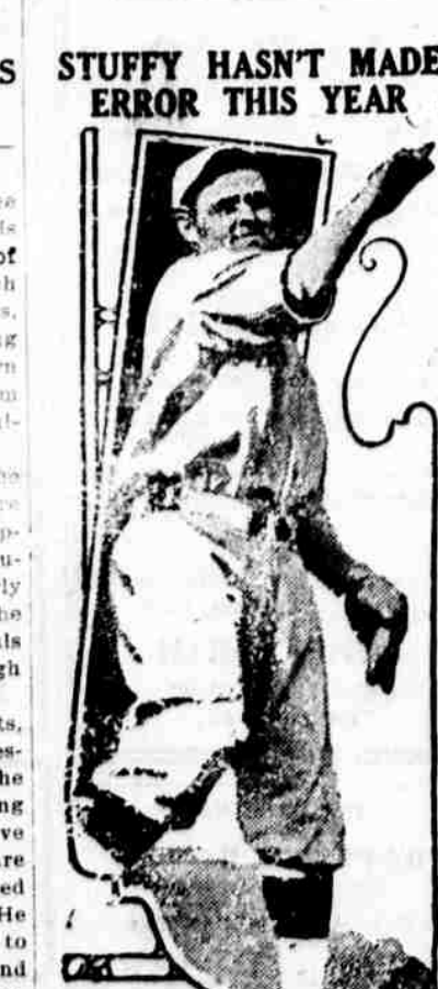
An errorless holding season has been the ground of most all baseball players. "Stuffy" McInnis, first baseman of the Boston Red Sox, must be having such visions now—because so far this season he has played a perfect game. In 35 games he handled the ball 421 times for 401 putouts and 20 assists for a .1000 percentage.