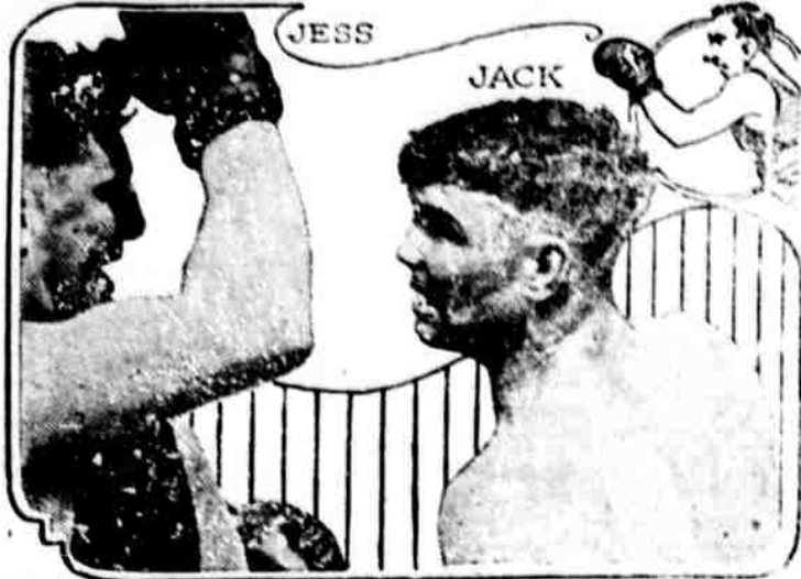
This composite picture shows how champion Jess Williams and challenger Jack Dempsey will look as they face each other in the earnestness of battle for the fistie honors and title as king in all fistie realms. Both these snapshots are from the training camps at Toledo, O., where the big bout is to be staged July 4.