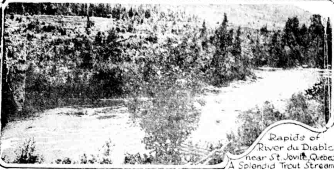
Rapids of River du Diable near St. Jovite, Quebec. A Splendid Trout Stream.

Here is something to interest fishermen. Lake Dumouchel is full of red trout that you can catch as fast as you can bait and throw in your line. And where is this Lake Dumouchel? It is three miles north of Mont Laurier, which is at the end of a railway running out of Montreal 160 miles northwest to the Laurentian Mountains.