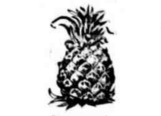
Pineapple A favorite fruit flavor