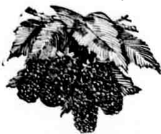
Loganberry Our finest berry flavor