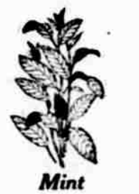
Mint For garnish jell

There are four flavors in Jiffy-Jell which are particularly delightful. Two are dessert flavors—Loganberry and Pineapple. One is Lime-Fruit flavor, for salads. One is Mint, for garnish jell.