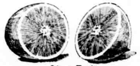
Lime Fruit Makes a tart, green salad jell