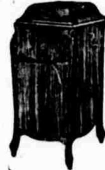
VICTROLA XI, $115