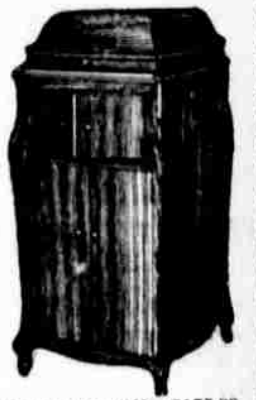
VICTROLA XIV, $175.00