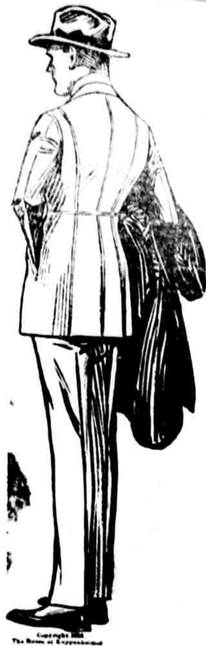
Copyright 1919 The Kuppenheimer Co.