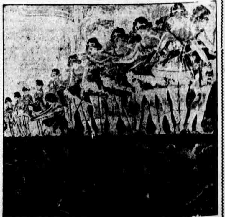
FLIRTATION WALK—AN ILLUMINATED RUNWAY EXTENDING FROM THE STAGE NEARLY HALF WAY TO THE REAR WALL—OVER THE AUDIENCE.

Flirtation Walk; An Aerial Flight; Girls' Aviation Corps in Action; Ballet of Bewitching Beauties; Brigade of Wonderful Girls.