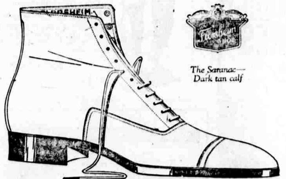
The Saratoc—Dark tan calf

the chaser squadron which would surround the spot indicated and drop depth bombs. The U-boat would be in great danger even if running far below the surface. The Navy Department carefully guarded the secret of the detector tube's construction during the war and this is the first photograph showing the operation of the arrow indicated.