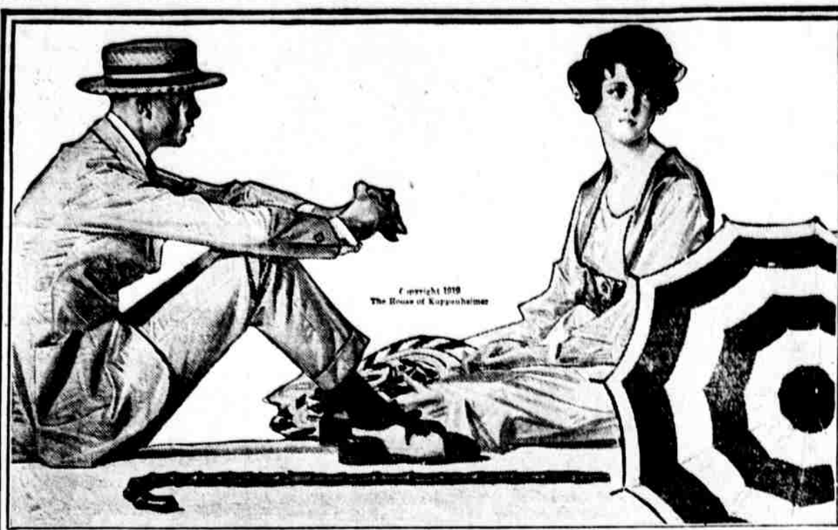
Copyright 1919 The House of Kuppenheimer

pull together and keep down all fires and have none, if possible. We intend giving you the best of protection and ask you to help us.