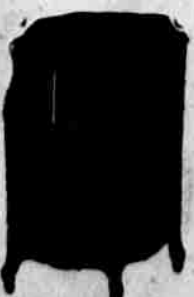
Victor Victrola XIV $175.00

EARL SHEPHERD CO., Standard Proven Quality Instruments Next Door to Postoffice.