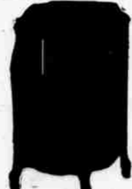
Victor Victrola XI $115.00