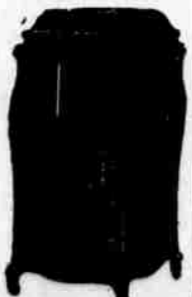
Victor Victrola XVI $225.00

EARL SHEPHERD CO., Standard Proven Quality Instruments Next Door to Postoffice.