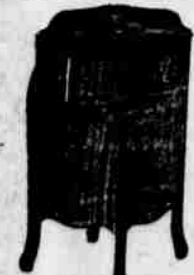
Victor Victrola X $90.00