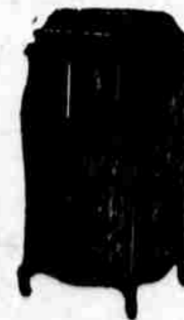
Victrola XIV. $175.00