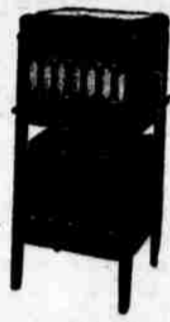
Sonora All Record $50.00