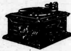
Victrola VI., $85.00