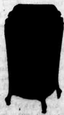
Sonora Invincible $275.00