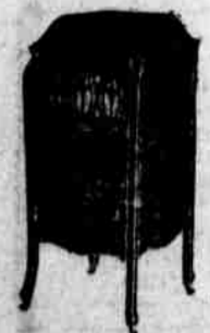
Sonora All Record $120.00