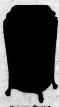
Sonora Grand $300.00