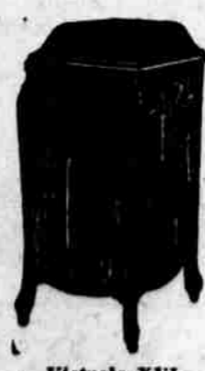
Victrola XVI. $225.00