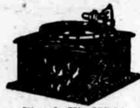
Victrola IV., $85.00