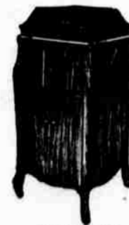
Victrola XI. $115.00