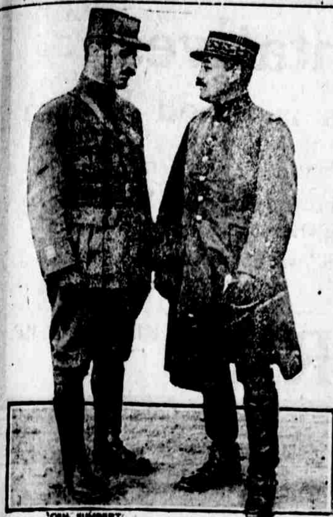
General Humbert, whose army in France whom Marshal Foch depends on to push the Germans back to their own border.