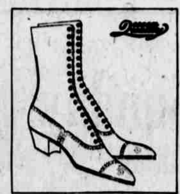
Gray Kid, Cloth tops, medium heel .....$7.50