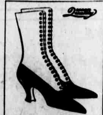
Brown, field mouse and gray, all kid, Louis heel .....$12.50