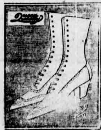
Brown Calf, cloth tops, medium low heel .....$6.50

Another express shipment opened, including the popular colors of Gray, Field Mouse and Browns. Medium low and Louis heels. When you want a good shoe buy Queen Quality.