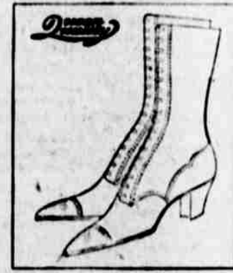
Brown Calf, with calf tops, medium low heel .....$8.00