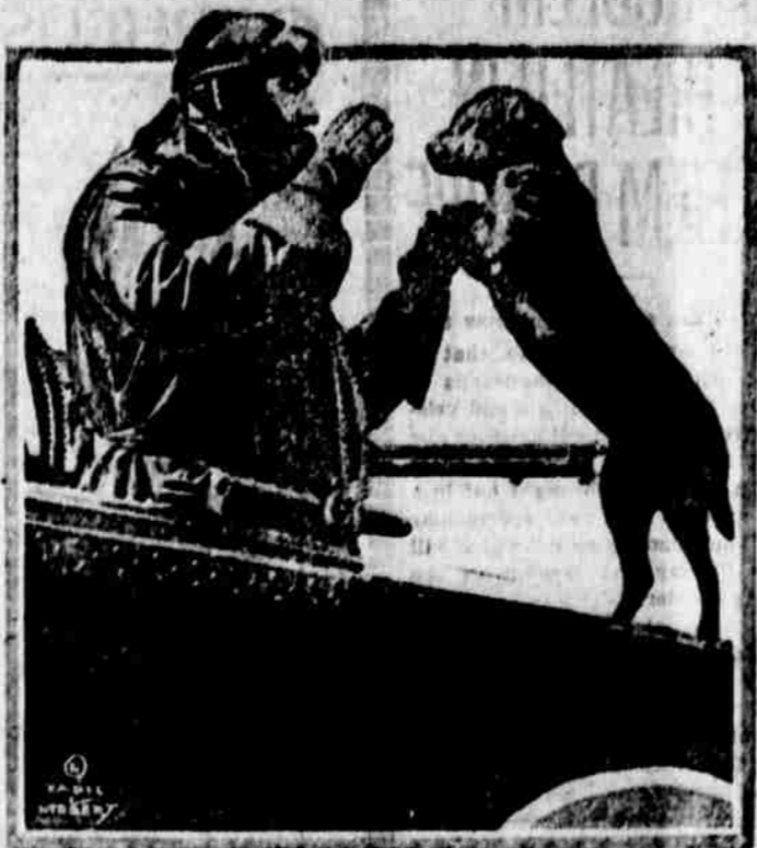
This airplane mascot of the British flying corps is not afraid to go in the air. Occasionally he does acrobatic stunts at dizzy heights. Many times he has been up with aviators who have shot down German planes.

cruel devastation wrought by defensive fighting against the German legions on their own soil, but war has come by air, and just as it has been necessary for the Entente Allies to bomb German billets in Belgium and French towns, so they have frequently had occasion to bomb Luxembourg and with deadly effect.