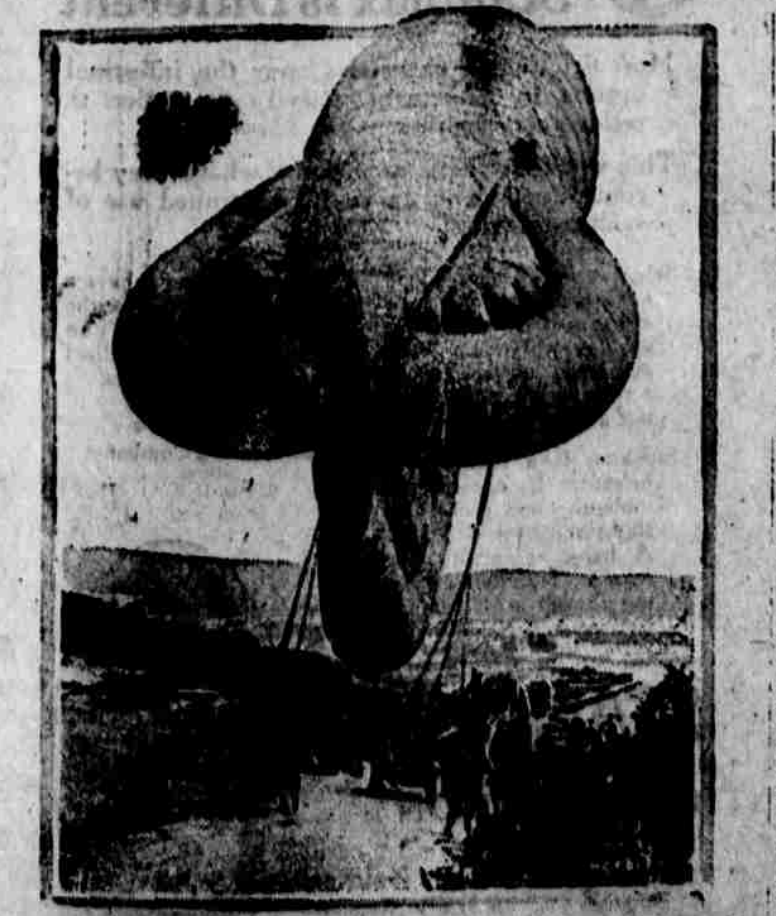
The great observation balloons, of which this is a close picture, is the eye for the great guns of the British on the western front. Without them