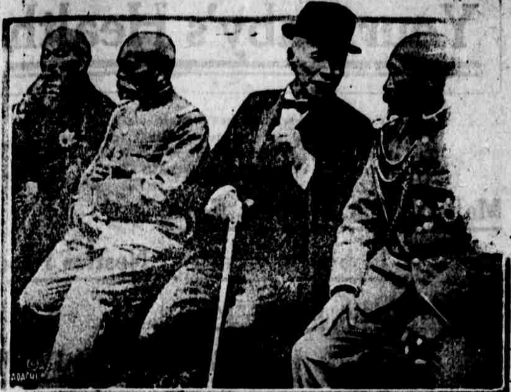
Marquis Okuma, here shown in the civilian dress, several times premier, of Japan, is here shown in consultation with the present military chiefs.