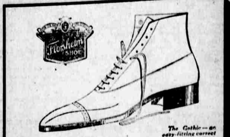
The Gothic—an easy-fitting correct shape of the season