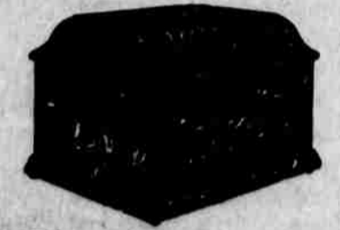
$50.00 Victrola on convenient terms. Shepherds, next door to post office.