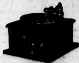
$12.00 to $22.50 At SHEPHERD'S

Oregon—Fair in westerly portion. Showers and cooler in east portion. Wednesday, fair, moderate westerly winds. Maximum—57. Minimum—55.