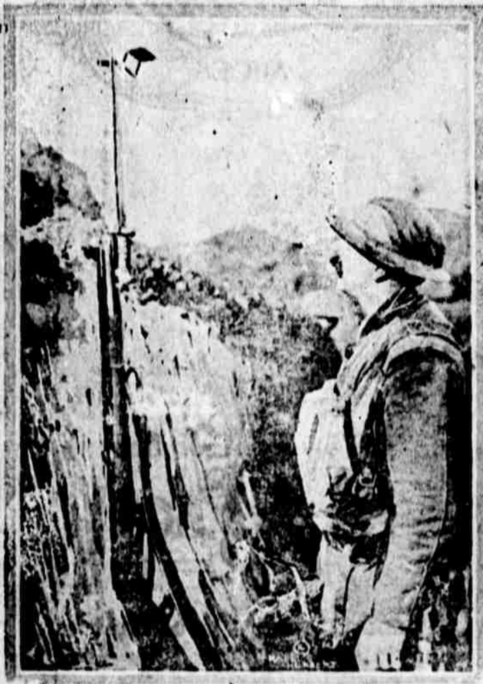
British soldiers on the western front have a pocket periscope which they fasten to their bayonets, thus reflecting the activities of the Boche in the trenches behind. This soldier with his back to the Boche can see every action of the enemy.