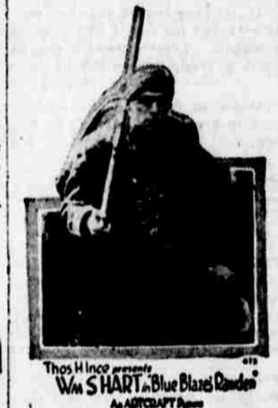
Wm. S. HART in Blue Blazes Rawden