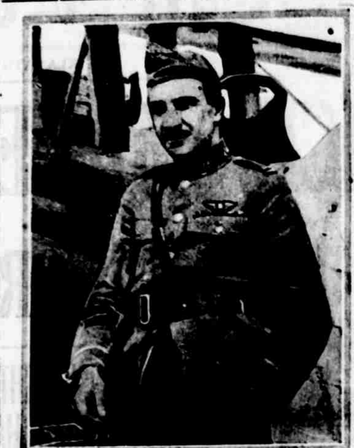
CAPT. JAMES NORMAN HALL

the Germans. He was formerly a member of the Lafayette Escadrille. Later he joined the British army. He is the author of "The Kaiser's Mob."