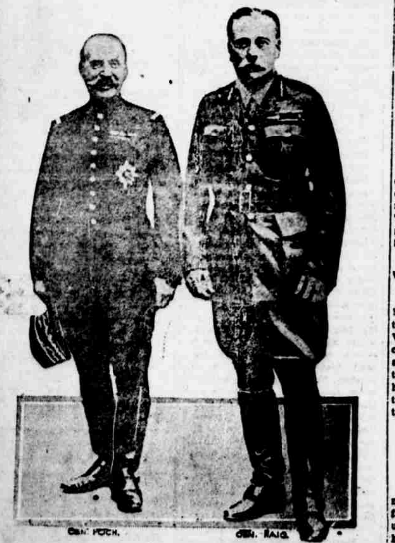
This is the latest photograph of General Foch, now commander in chief of the western front, and General Haig, commander of the British, whose heroic resistance to the great German drive has been one of the great features of the war.