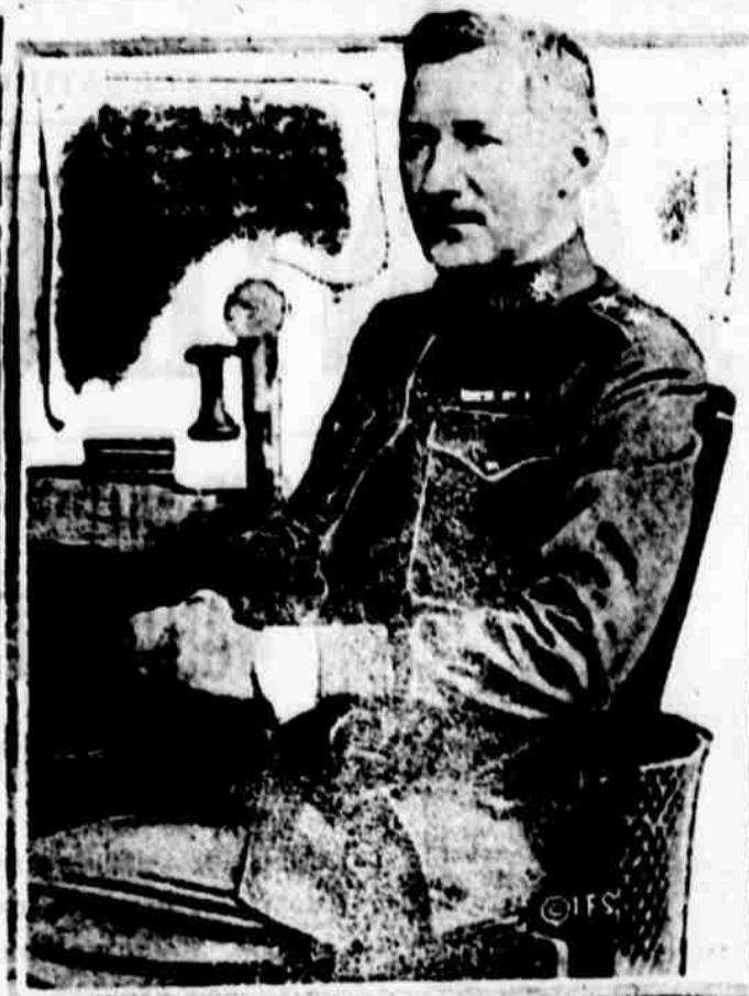
Maj. Gen. PEYTON C. MARCH

"We must strip for action," said General March, acting chief of the general staff of the United States army. He said this in connection with the recent order that gifts to soldiers