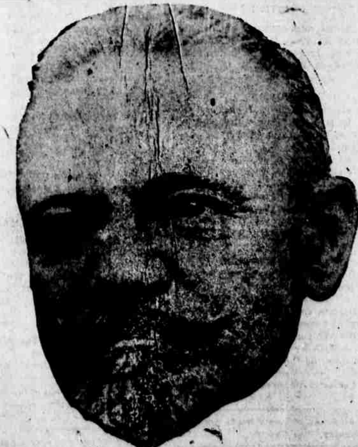
GEN. VON GALLWITZ

General von Gallwitz, who destroyed Serbia when in command of a German army, has been transferred to the western front, and it is now believed he is in command of the troops facing the Americans near Lunoville. His path thru Serbia was strewn with ruined homes.