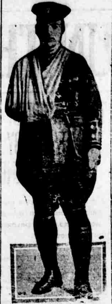
JACK MONROE Jack Monroe, who rose to fame when he knocked down Jim Jeffries in a bout in Butte, and later proved by whipping Tom Sharkey that he could fight, returned from the battle front to help Uncle Sam in the Third Liberty Loan. This last photograph of him shows his arm in a sling because of a wound in battle.