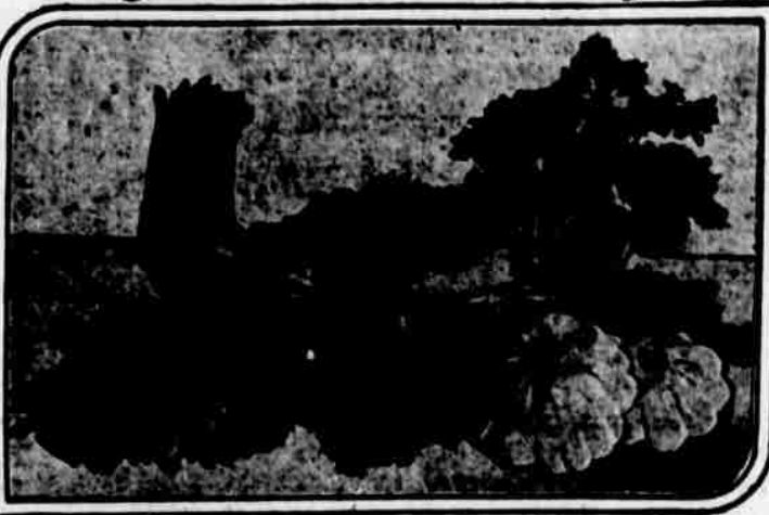
HELP INCREASE OUR EXPORT FOOD STOCKS

N CITY and country more war gardens are needed this year than ever before. Patriotism prompted 2,000,000 Americans to plant gardens last year, according to estimates of the United States Department of Agriculture. Transportation facilities of the nation will be strained this year hauling munitions of war and foods for the Allies. The surplus food created by home gardens will help in the railroad problem. And the nation will eat less of the goods we must export--wheat, meat, fats and sugar. Every boy and girl that helps with the garden is helping win the war. Leaflets of instruction in garden making may be secured from the Department of Agriculture at Washington, upon request, without charge.