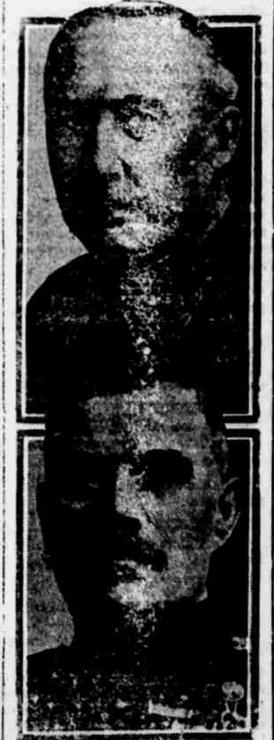
General SIR HENRY WILSON

The removal of General Sir William Robertson as chief of the general staff of the British armies, and the appointment of General Sir Henry Wilson to his place, have created a storm about the head of Premier Lloyd George of Great Britain. The London public has been very much agitated about the situation.