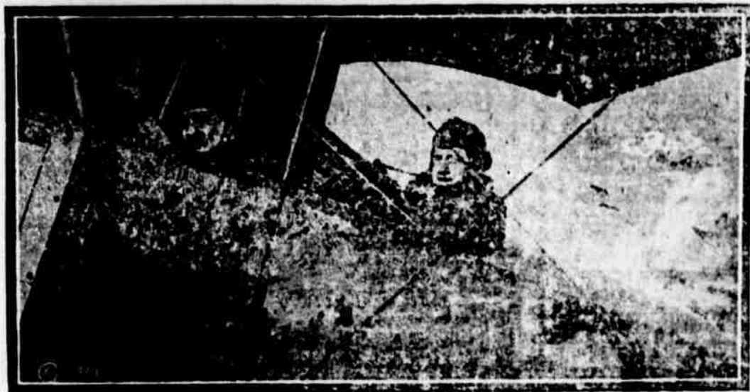
The man in the back of the aeroplane body is an American photographer with his camera, starting on a trip over the German lines to photograph them for use of American soldiers holding down a sector of the western front. Americans are regularly flying over the enemy lines.