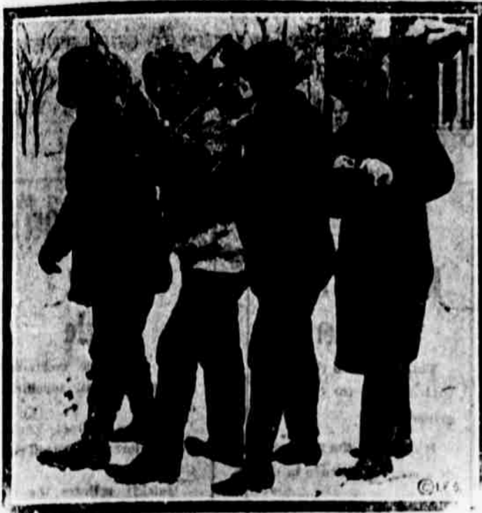
Chicago streets were piled so high with snow after the big storm that even the women were called out to help clean sidewalks and crossings. This photograph shows four of them, dressed in the clothing of their husbands or brothers, with their shov-