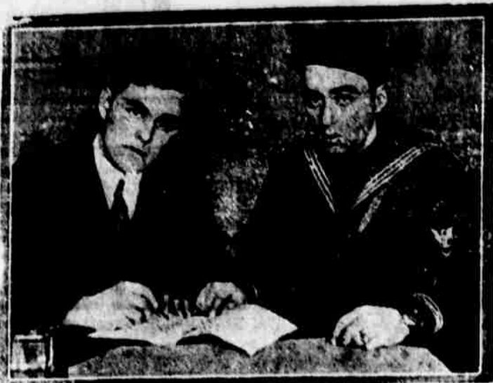
STUFFY MCINNIS JACK BARRY

"Stuffy" McInnis, last of the great members of the Athletics, the baseball club with which Connie Mack won several world's championships, is here shown signing his contract to play first base for the Red Sox of Boston.